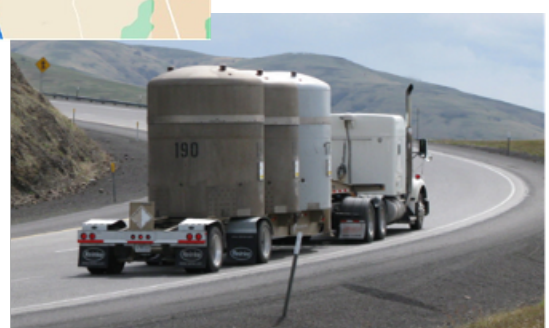
These trucks will carry the waste past our homes.

“If you are in one of the communities along the route, you have something to worry about.” High-level Energy Department official, who spoke on condition of anonymity. https://www.latimes.com/nation/la-na-nuclear-couriers-20170310-story.html